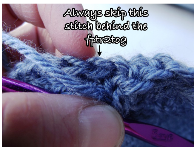
Illustration 5: Skip the stitch behind the fptr2tog and continue in pattern around.