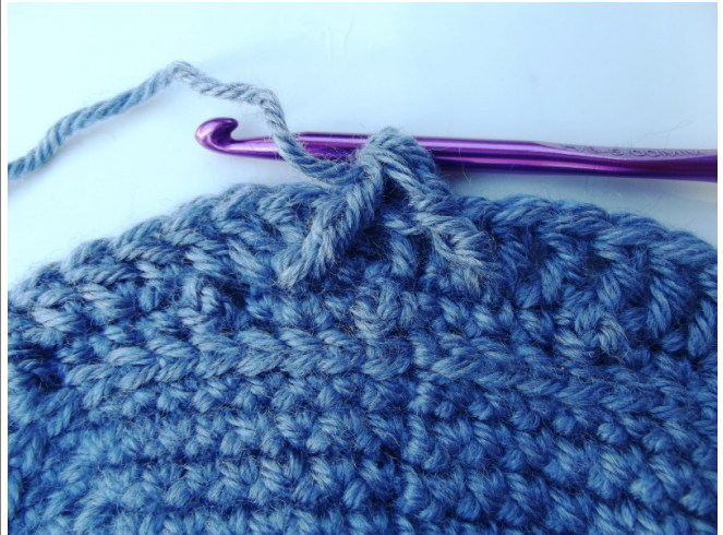
Illustration 1: First fptr2tog completed