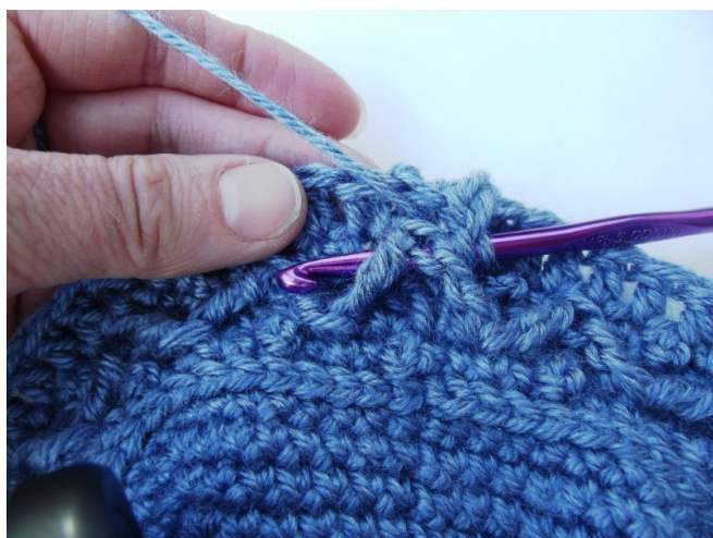
Illustration 10: Make sure to always go underneath both posts.