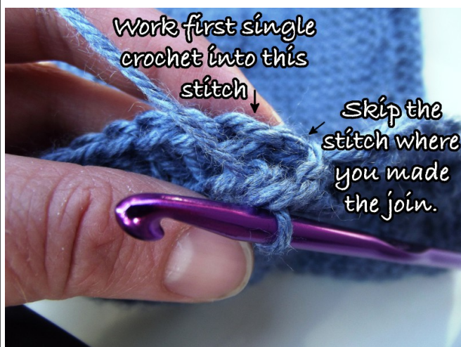
Illustration 2: Always skip the stitch behind the fptr2tog