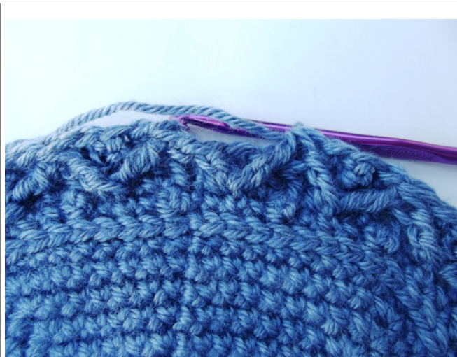
Illustration 7: The last fptr2tog connected to the first one.