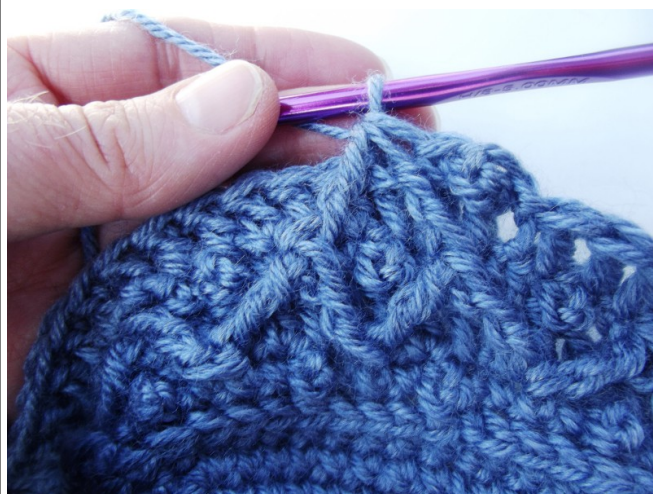
Illustration 11: First fp2tog complete.