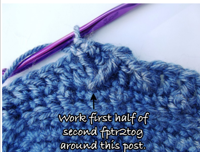
Illustration 3: Work first half of second fptr2tog around same post as last fptr2tog.