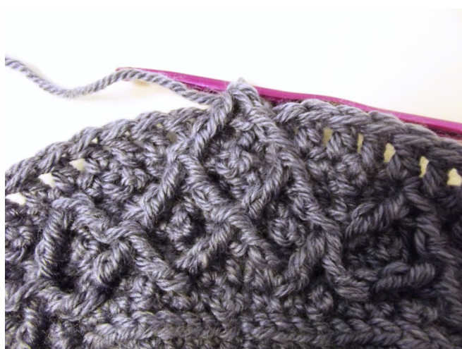
Illustration 12: For third rnd of fp2tog, work first fp2tog around last and first fp2tog from two rounds below.