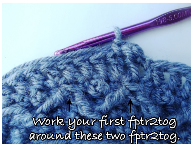
Illustration 9: Work the first fptr2tog underneath the first two fptr2tog made two rounds below.