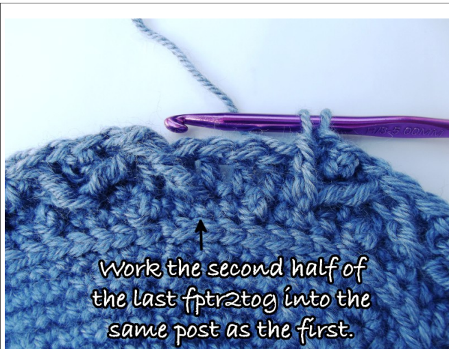
Illustration 6: Last fptr2tog is connected to the very first fptr2tog by working the last half around the same post as first half.