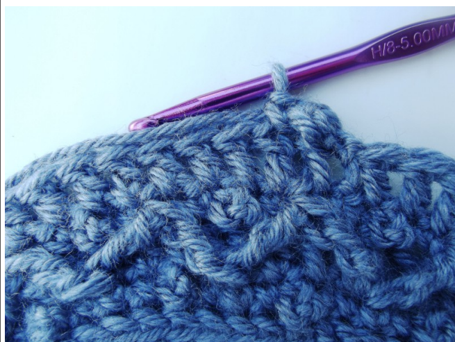
Illustration 8: Second rnd of fptr2tog is started with the bead stitch and a single crochet.