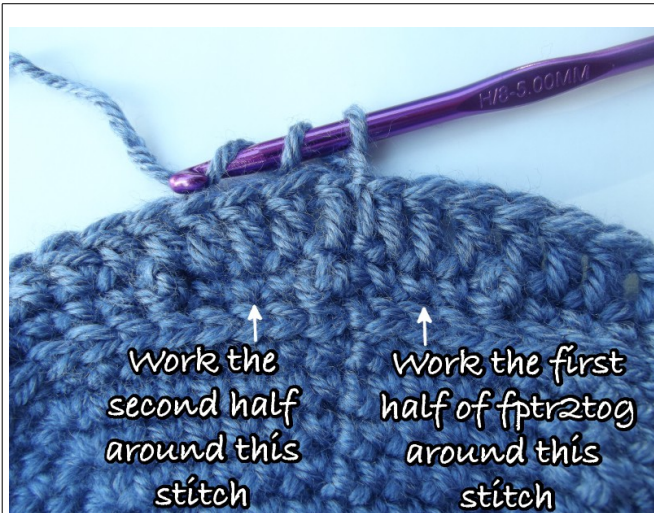
Illustration 1: First Rnd of Fptr2tog - Work the first half of the fptr2tog around the second from last stitch 2 rounds below. Count over 3 stitches and work the second half. Tip: the fptr2tog are always worked in the center single crochet between the bead stitches.

Here is a tutorial to help with the cabled diamonds stitch. Please read over it and come back to it as needed.